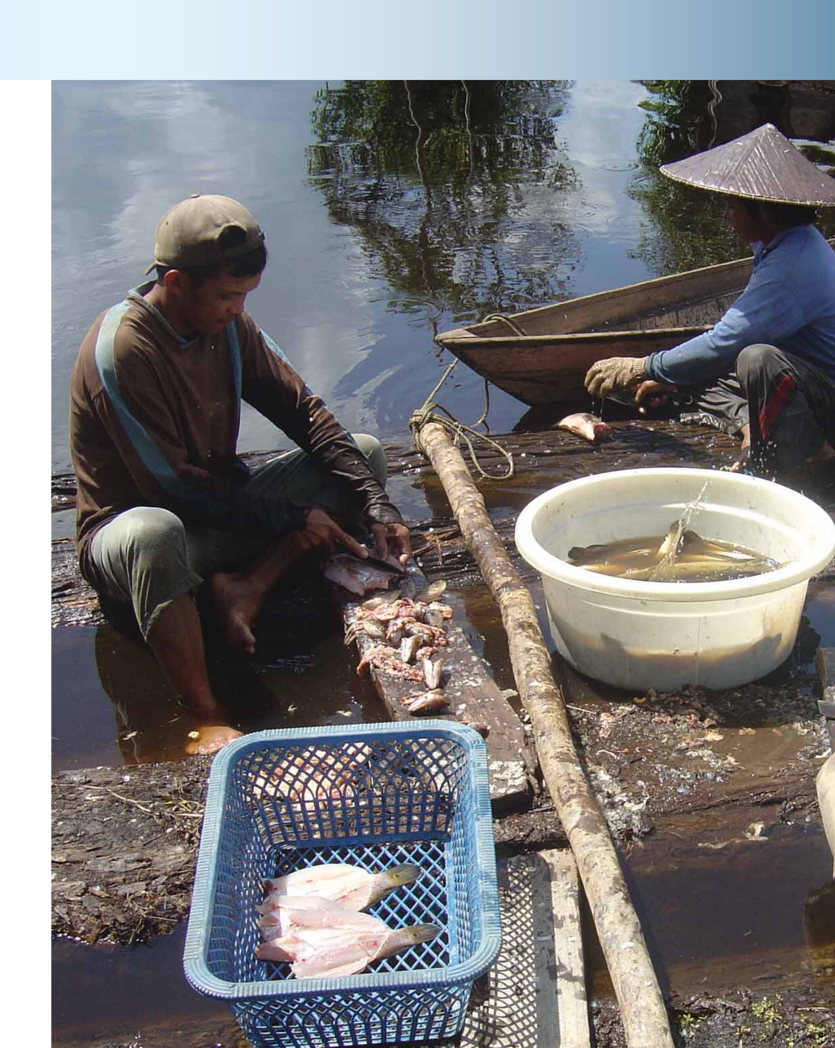
Photo: WWF is committed to ensuring that forest carbon projects also promote environmental and social values. A pilot project in Indonesia is restoring peat swamp forests as natural carbon reservoirs, while providing income-generating activities such as fish farming.

The Nepal pilot approaches the 'testing' of standards from a very different angle. In this project, WWF plans to explore the effectiveness of the social and biodiversity components reflected in the MSF, as well as the feasibility of using carbon financing to incentivise forest conservation. By generating carbon finance from the restoration of riverine forests, the project aims to provide revenue streams to local communities as incentives to tolerate tigers as neighbours and to create habitat to minimize direct human-tiger encounters in the course of normal activities. The pilot project will also help demonstrate how the different elements of the MSF fit together for a comprehensive assessment of the combined benefits of enhancing livelihoods, conserving biodiversity and mitigating or curbing climate change. The hope is that all these elements will benefit similar carbon-financed conservation initiatives around the world.